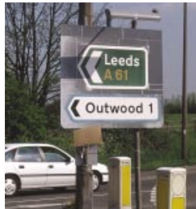
The very name 'Outwood' encourages an exploration of the local landscape's history

The Outwood project shows how local people can be reconnected to the landscape through an understanding of the past cultural, environmental and economic uses of the forest. By discovering surviving evidence of the past, they can develop a greater sense of stewardship and a determination to hand on their heritage to future generations.