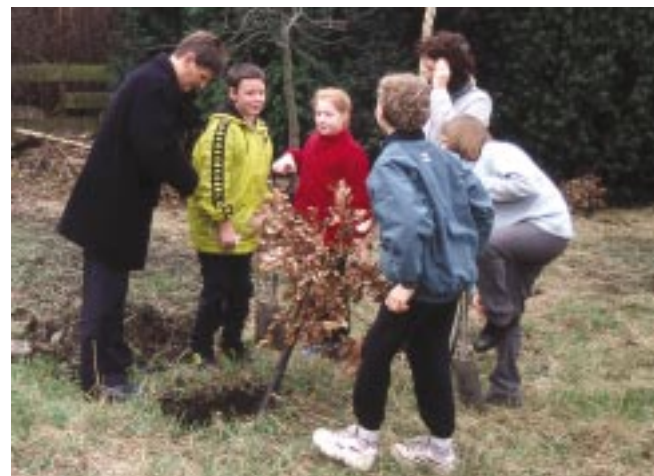
Planting trees for the future is a practical way for local people to acknowledge the past