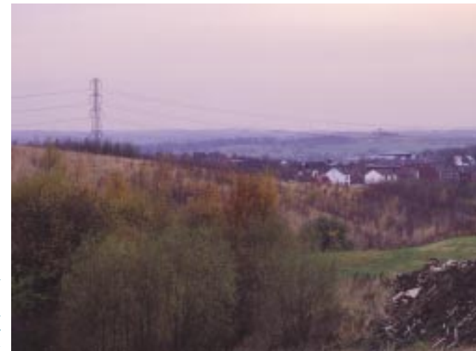
Even in this much-changed landscape, there is still plenty of evidence of the wooded past – if you know where to look

The Outwood project is a partnership of local people, scientists, the local authority, the Forestry Commission, English Nature and others. Together, they have carried out research and mapped the boundaries of the Outwood. The research has drawn on many sources, but particularly important have been the court rolls of the Manor of Wakefield which date back to the 14th century and which are a rich source of personal detail from the past. Who worked in the Outwood? Who used the trees, allowed their animals to trespass, quarrelled with neighbours, or who fell victim to highway robbery?