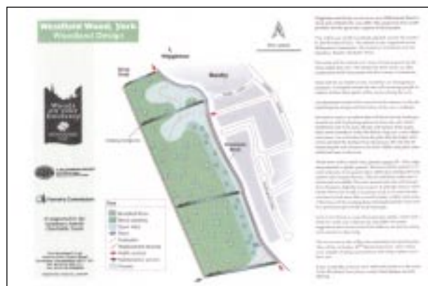
A leaflet from Westfield Wood, showing a routemap which makes public access easier

Westfield Wood has been planted on 6 hectares of formerly arable farmland on the northern side of the York ring road, next to the communities of Wigginton and Haxby. It is roughly rectangular with housing next to the eastern boundary and open fields on the other three sides. There is an existing public right of way running down one edge.