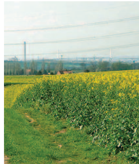
Figure 3 Typical farm setting showing oil seed rape as a main crop. Soil analyses will consider nutrient status and presence of a plough pan.

Subsample of the samples analysed for potentially toxic elements, essential nutrient availability (including Ca, Mg, K, Fe and Mn), CEC, particle size distribution, stoniness and bulk density.