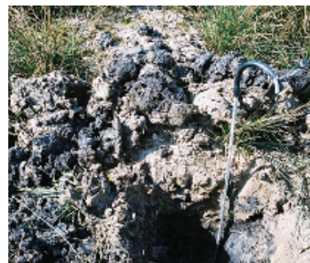
Figure 1 Soil sampling: a hand-dug trial pit to investigate soil characteristics and profile depths.

Soil sampling should only take place once a site history has been ascertained and a conceptual model of environmental conditions and potential risks has been constructed and reviewed as part of a Preliminary Site Investigation Survey (Phase I). Soil sampling forms part of the intrusive site investigation (Phase II) and provides data for the processes of site evaluation and risk assessment. Subsequently, a risk management strategy is devised for all the identified risks (Phase III), or a site action plan may be devised, for example, for adjusting the soil conditions to suit vegetation establishment. As such, soil sampling should be undertaken by qualified environmental consultants. An introduction into the site selection and risk assessment processes for identifying suitable locations for greenspace establishment is given in an FC Information Note (in preparation): Greenspace establishment on brownfield land: the site selection and investigation process . Additionally, in-depth information on the procedures involved in site assessment can be obtained from the FC Land Regeneration Unit (England): Phase 1 Survey specification – preliminary site investigation and feasibility reporting on potential community woodland sites .