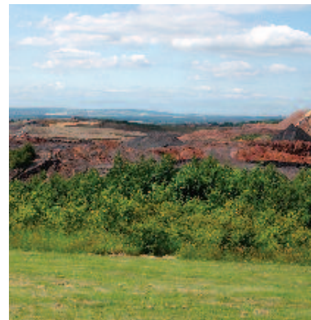
Figure 4 Open-cast working site displaying the variability in site conditions alongside newly planted reclaimed land, in the foreground, the fruits of successful investigation and planning.