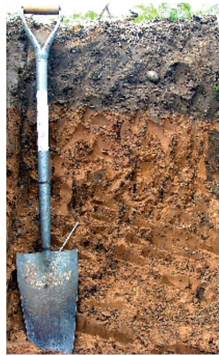
Figure 5 Soil profile pit useful for studying soil types with depth, investigating rooting depths and sampling soils for chemical analysis.

Sample analysis All samples analysed for Diazinon, metabolites of Diazinon and harmful impurities of the proprietary insecticidal treatment.