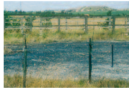
Figure 6 Seven-year-old tree planting on an acidic colliery spoil in the West Midlands, England, showing total mortality.

Subsample of the samples analysed for electrical conductivity, total S, available N and P, total N, plus Ca, Mg, K, Fe and Mn.