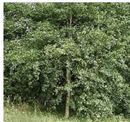
Figure 2 Italian alder: an example of a species that grows well on reclaimed land.