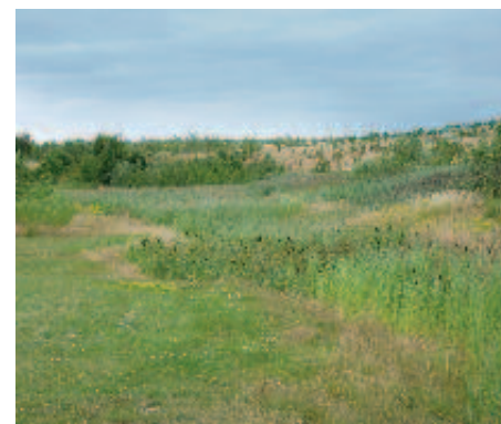
Figure 1 Restored sites often require cultivation prior to vegetation establishment.