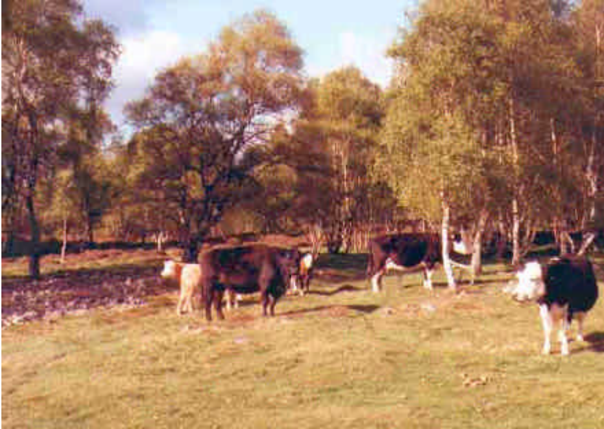
Cattle grazing in birch wood pasture on Muir o'Dinnet

animals are part and parcel of a wood pasture system. Wood pasture is in effect a grazing maintained habitat, just like old flower-rich hay meadows.