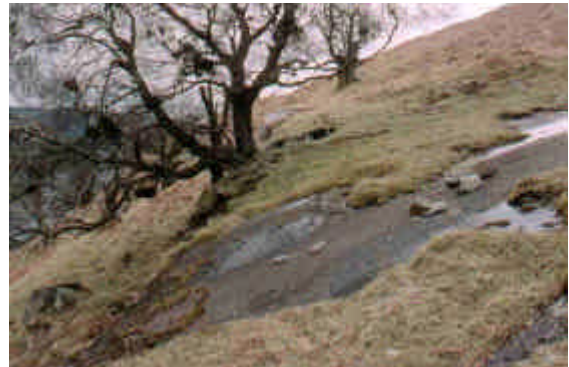
two views of high level wood pasture above Loch Earn

In many wood pastures enormous veteran trees especially alder can occur right at the current tree-line, at well over 300m elevation.