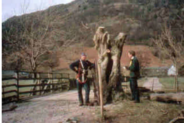
l -ash pollard in Seatoller wood; r - national Trust staff repollarding an ash at Hartsop

The National Trust are encouraging their tenant farmers to revive this practice mainly for traditional landscape restoration reasons (see outstanding examples in Watendlath valley), but also to improve the habitat niches in old pollards for specialist species, particularly lichens and invertebrates.