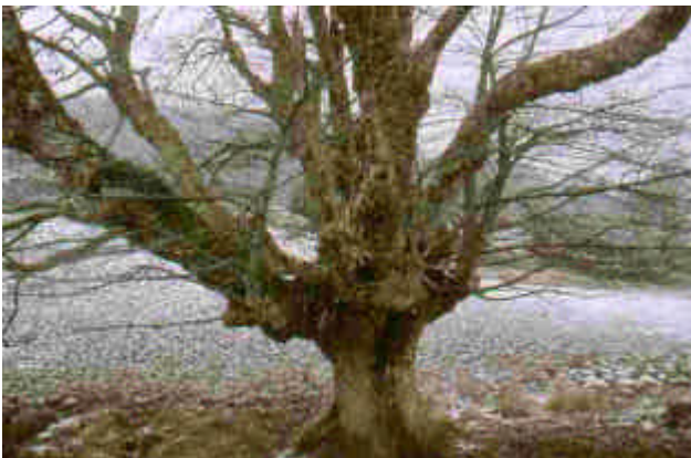
l: sycamore pollard, Lochgilphead r: ash pollard near Luss