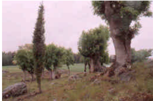
ash pollard at Farnborg, Aland Islands, Finland recent re-pollarding at Borsa Isle, Sweden

All these areas carried on a classic tree leaf-fodder pollarding system, in a number of native broadleaved species, but especially in ash, elm, birch, and goat willow. Over a long time this process results in a particular shape of tree, which is retained for at least a century after the pollarding stopped. In these countries too, a certain amount of pollard restoration is being done to preserve flower rich ' pollard meadow ' habitats, and also as part of the restoration of traditionally farmed cultural landscapes.