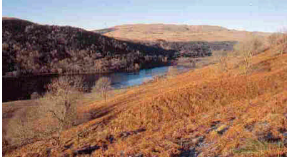
very open parkland at Glen Shira with scattered ash and sycamore with some oak and sweet-chestnut. A top rate lichen site

Some sites show quite clearly that given respite from grazing for a prolonged period, wood pastures will seed from the older trees and regenerate. Achnatra Wood on Loch Fyne is one such place, and the scattered veteran ash are still visible on adjacent land to show the sort of open wood pasture the site may have been, before a stock fence erected several decades ago allowed recovery. The open wood pasture in the adjacent Glen Shira is in fact one of the best habitats for old growth lichens in Scotland.