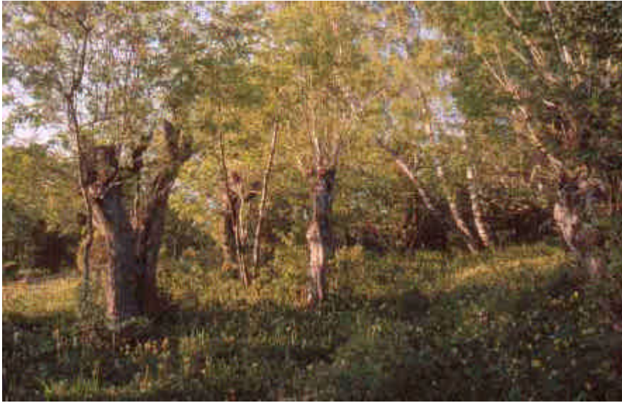
pollard meadow at Nato nature reserve, near Mariehamn, Aland Islands, Finland