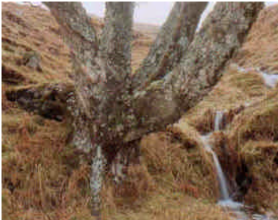
ancient multi-stem birch, Nevis

There is not yet a national inventory of either wood pastures or veteran trees in Scotland. Some local or regional surveys have been done, and SNH are now beginning to compile an outline inventory. It is also expected that land-use surveys will in future recognise wood pasture as a distinct habitat type, and so survey and map it as such. In the meantime, we need to be able to recognise a wood pasture when we see it, and the main purpose of this guide is to give enough information on the typical features of wood pasture so that anyone can do just that. Here are just two examples: huge old isolated trees in upland hill pastures, and interesting rot fungi inside veteran trees.