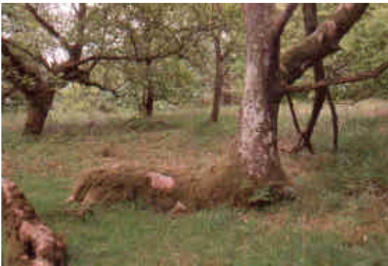
Old phoenix oak in wood pasture, Carstramon wood

Small-leaved lime, a rare native tree which now grows only as far north as the Lake District, seems to be hanging on in various gullies in Lakeland woods by vegetative growth, and can thus apparently survive against all the odds, even though it is now too far north to set viable seed.