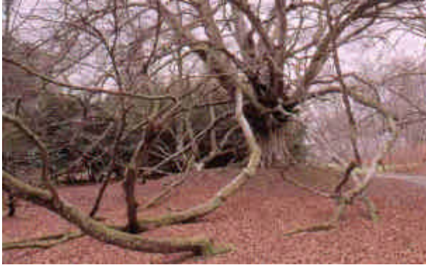
layered beech tree in Kilravock park