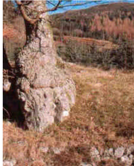
Strathyre: two massive old wood pasture relicts, previously coppiced, then grazed in a wood pasture, then afforested on the hill behind. One seems to be flowing over the rock..

Neither were veteran trees and open wood pastures tolerated during 19thC farming and estate improvements, unless they could be included as an ornamental feature within the designed landscape. Indeed the heart of agricultural improvement at that time was to enclose and improve land that had previously been unenclosed grazings. In some ways the wood pastures that remain today escaped that process, or survived, but somewhat as anachronisms. Shielings and other settlement ruins abandoned at that time are now almost a feature of wood pasture, as we shall illustrate later.