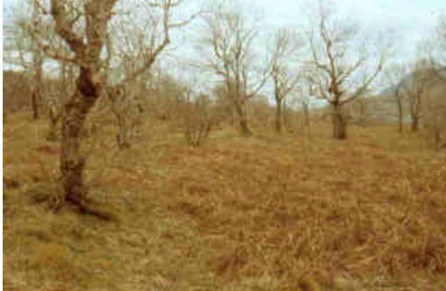
un-wooded terrace in Rassal ashwood

While Rassal ashwood does not contain classic pollards, it does have a lot of other features pointing the way to it being a cultural landscape artefact rather than a purely natural woodland. The main feature is the way that the oldest trees are sited on old limestone banks between flat smooth terraces, edged by what seem like stone clearance cairns, or short dykes. If trees are growing on some of these terraces, they are usually young, and never of the older age classes.