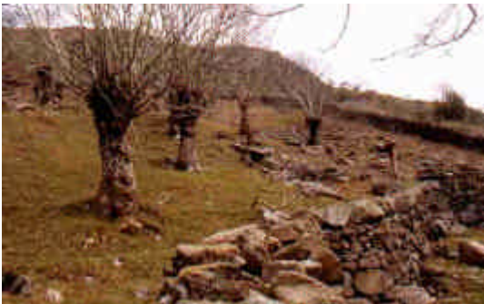
ash fodder pollards in Watendlath, and . . .

The second set of wood pastures are those which are not part of designed landscapes, but have evolved over the centuries through the interaction of ordinary country folk - engaged in nothing more glamorous than eeking a living from the land. The practice of pollarding long predates the cosmetic treatment of parkland trees in the early 19 th C. Even at that time there must have been a folk memory of a much older practice which in many districts was part of farming life itself: the cutting of branches and leaves for feeding to domestic livestock. This fodder pollarding is known to be the cause of the characteristic pollards which are frequent in the Lake District valleys of Borrowdale and Langdale, and may also be seen in the hedgerows and open wood pastures of other upland areas in north England.