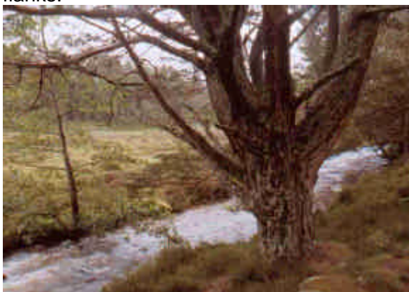
open grown riverside pine in Rothiemurchus Forest

Even areas containing major pine forests such as Abernethy, Rothiemurchus and Mar were once medieval hunting forests (Gilbert, 1979). Many native pinewoods are not only of wood pasture structure, but also merge into true broadleaved wood pasture on their flanks.