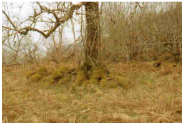
l: ash on stone dump, Rassal r: non-pollarded but burry old oak on edge of terrace

Once the system was abandoned, the trees would grow on, seed into gaps, and become a sort of woodland.