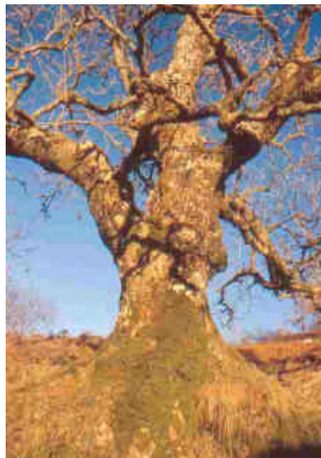
l: canker wounds on veteran ash, good sites for lichens – white patches of lichen Lobaria amplissima r: an open grown outgrown pollard ash in the open parkland of Glen Shira

The infill process - given protection against grazing, hazel stools re-sprout, alder and birch seed in large patches, while ash and elm close canopy and send up vigorous