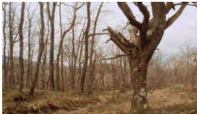
second view at Strone

This varied history of utilisation, exploitation and management helps explain the range of condition in today's pasture woodlands. Knowing this history, together with an assessment of surviving ecological benefits and threats, gives us information to help decide the best future management for the wood pastures of Scotland.