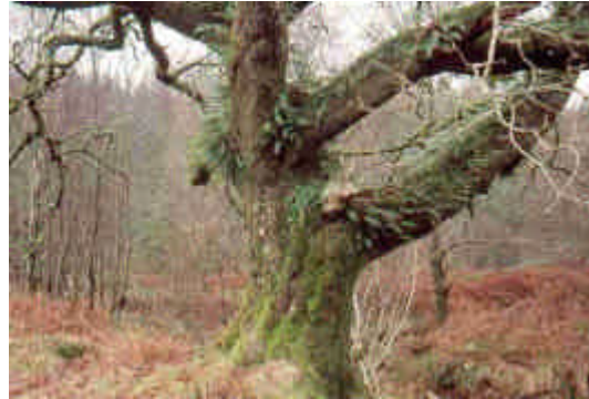
veteran pollarded oak at Stonefield, Argyll

Finally by being ancient, wood pastures are by definition historic! Indeed they have a real sense of history about them, and maybe that helps explain their popularity. Many of the features of wood pastures that we will be looking at later are of a historic character. Because veteran trees are themselves a kind of living ancient monument, this brings us into the realms of woodland archaeology, but where the ancient living things are of as much interest as the built structures and the earthworks. This too is significant, because wood pastures are not just a natural phenomenon, they have had the hand of man in their making. They are in fact part of the man-made or cultural landscape just as much as they are part of a natural landscape. But when we come to look at naturalness, certain types of wood pastures also excel themselves in being one of the most natural origin woodland types in Britain today!