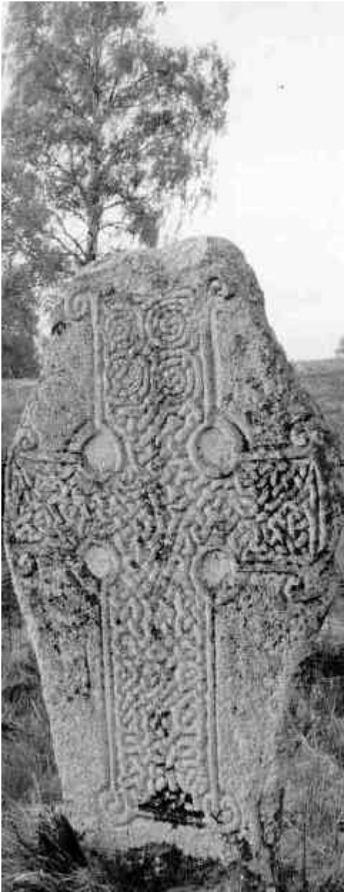
Pictish stone, Muir of Dinnet

Of course this learning curve has not been done entirely on my own, and I would like to thank all those foresters, conservationists, writers and historians who have helped make this journey of discovery so interesting and enjoyable. It is a journey that is by no means finished yet, as there is always more to discover in both the natural world, and in the realms of history. However I do believe in making knowledge widely available, and without waiting until all the i's are dotted and the t's crossed!