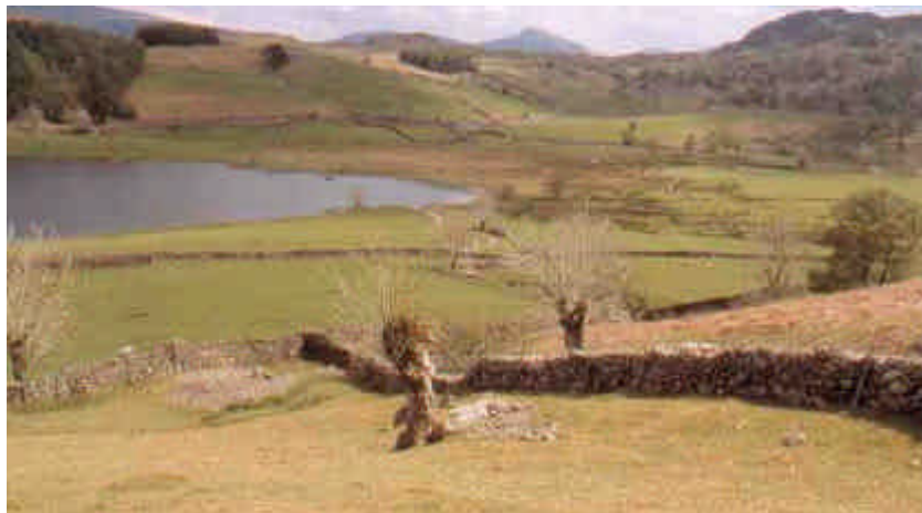
veteran ash fodder pollards in a cultural landscape, Watendlath, Lake District

Finally by being ancient, wood pastures are by definition historic! Indeed they have a real sense of history about them, and maybe that helps explain their popularity. Many of the features of wood pastures that we will be looking at later are of a historic character. Because veteran trees are themselves a kind of living ancient monument, this brings us into the realms of woodland archaeology, but where the ancient living things are of as much interest as the built structures and the earthworks. This too is significant, because wood pastures are not just a natural phenomenon, they have had the hand of man in their making. They are in fact part of the man-made or cultural landscape just as much as they are part of a natural landscape. But when we come to look at naturalness, certain types of wood pastures also excel themselves in being one of the most natural origin woodland types in Britain today!