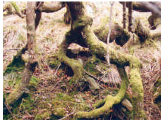
layered branches of bird cherry