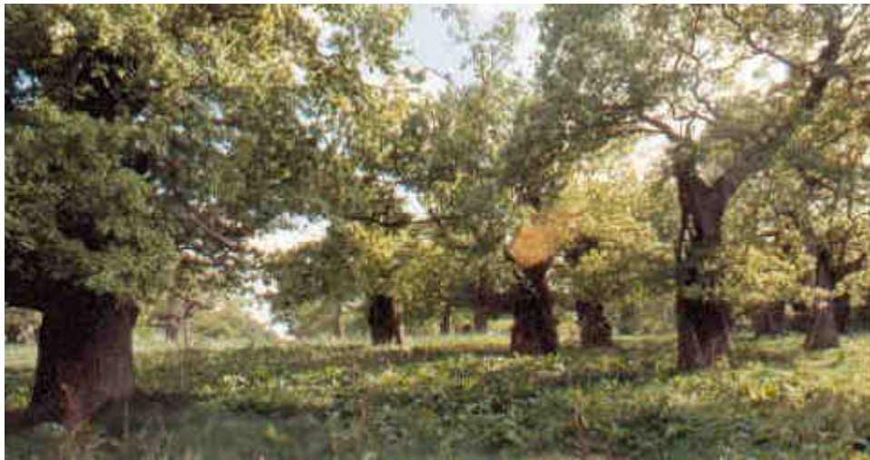
the Cadzow oaks, after grazing has ceased in part of this lowland wood pasture

The simplest type to explain is probably the lowland park type of wood pasture, where a park of scattered trees has been planted and allowed to grow very old. The veteran trees are almost a backcloth to the use of the park for hunting of deer and game over the centuries, and for grazing by livestock. One of the best lowland wood pastures in Scotland is known as the Cadzow Oaks , (and also as Hamilton High Parks).