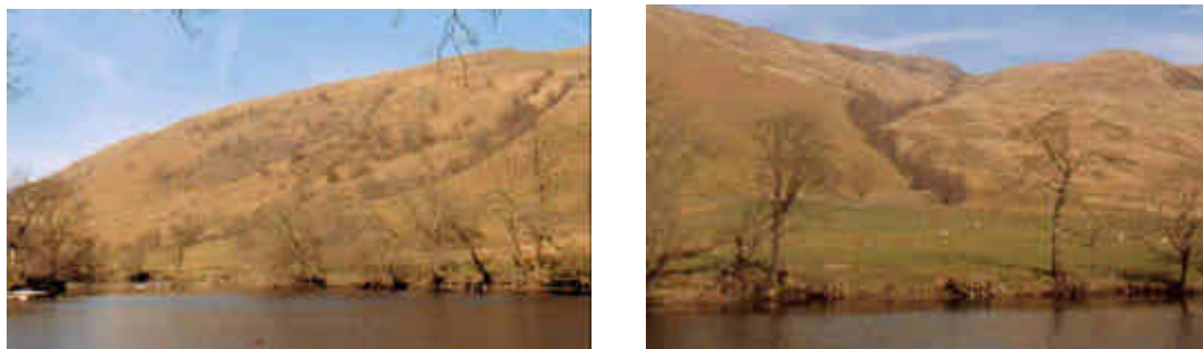
sw Glen Orchy showing (l) wood pasture and crag refugium; (r) a gully refugium just to the north

I would go so far as to hypothesise that many of today's poorest condition upland wood pastures are simply the long-suffering remnants of natural-origin, unenclosed, black-woods. These remnants may therefore be some of the most natural woodlands in the landscape, especially if they include undisturbed woodland refugia in deep gorges and on crags.