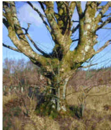
Classic sycamore pollard in the remains of a former 19 th C park attached to Kilmory Castle, Lochgilphead

Analogy with the built heritage can actually be a useful way of looking at wood pasture. So early wooden hunting-lodges were superseded by medieval towers, then by more comfortable castles, then converted to stately homes. Sometimes parts of the earlier built structures are still visible, and this is the same with ancient wooded landscapes. In the case of both designed landscapes and ancient woodlands we are looking at a series of overlain features (historians call this a palimpsest ), accumulated over a thousand years. The lifetime of some of the oldest trees in an ancient park may be more than half a millennium, and so this puts a very historic context to wood pasture.