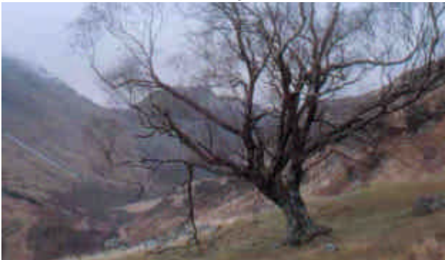
veteran birch beside a man-made platform, N-facing side of upper Glen Nevis

A feature of the second two types, but not the first, is that the wood pastures seem to survive best in areas which are somewhat remote, even by rural standards. So they are often on the shady north facing side of a glen or loch (eg Loch Tay, Loch Earn), and in places where the improving hand of our forefathers has touched but lightly.