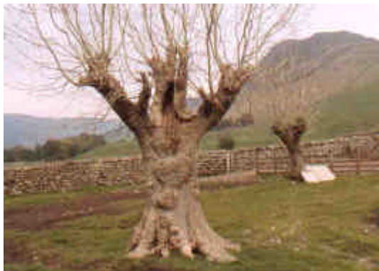
Langdale, Lake District