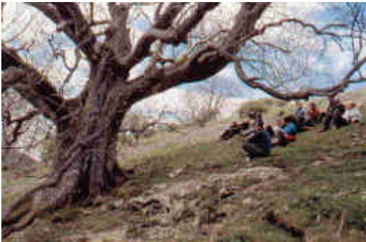
veteran ash at The Nest - ATF meet