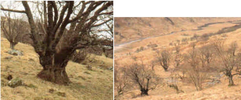
two views of slope-alder wood pasture at Glenfinglas. Massive alder on left also has a rowan 'air-tree' growing inside, a common feature in veteran hollow alders

It is known from historical documents that unenclosed 'black-woods' (non-oak natural-origin woodland), were grazed heavily in summertime throughout the 18 th C. If they were also cut for charcoal and then grazed without protection then obviously they tended to be lost completely. For example Letterwalton Woods, Barcaldine, were reduced over the period 1777 to 1871 from dense black-wood which provided substantial charcoal produce, to a mere 'thin scattering of trees' (Lindsay, 1976). Some of today's wood pastures may therefore have had this somewhat ignominious history. A century and more of grazing since they were last cut has allowed particularly the hardy alder to form a slope-alder wood pasture. In other places the long lived oak and pine, especially if open grown and therefore relatively resistant to windthrow, have survived to become today's veterans.