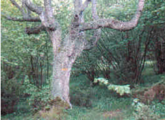
l: 'grown-out' pollard birch in Nato reserve r: the big birch pollard at Glenfinglas, beside old arable

One piece of evidence that constantly crops up in Scottish wood pastures is that while many of the surviving trees do not show strong evidence of previous pollarding, if you look at the very oldest trees on site, eg veteran ash of over 300 years age, these can indeed have a strong pollard form, though now of course grown-out. This can result in the classic old pollard candelabra shape (see Kilmory pollard photo above – sycamore holds the candelabra shape better than most species). Even when a pollard has blown over and regrown vertically to some extent, it still holds that shape as evidence for decades to come (good example of fallen ash pollard in Glenfinglas).