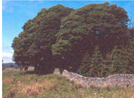
two views of the enclosing high wall to Cumloden Deer Park, Galloway