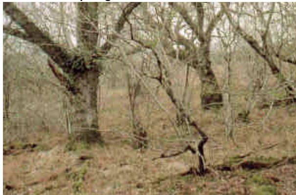
Ash and oak open-grown veterans within Achnatra