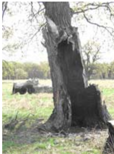
A tree trunk burned by man – miraculously still alive.

Now The Mihai Eminescu Trust, together with the local authorities, is in charge of managing the reserve for the next five years. With your support, we can hire trained park rangers to prevent illegal fires, ancient trees being cut down, unchecked grazing, waste, off-road motorcycle races and poaching.