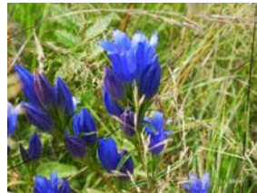
Marsh gentian ( Gentiana pneumonanthe )