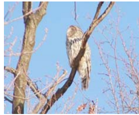
Ural owl ( Strix uralensis )

By adopting an oak, you would help save not only that particular tree, but also the hundreds of different species of plants, birds and animals that live on the Breite plateau.