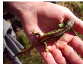
Sand lizard ( Lacerta agilis )