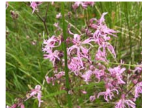
Ragged robin ( Lychnis flos-cuculi )

Breite is located on a hill plateau overlooking the medieval citadel of Sighisoara, a UNESCO World Heritage site.