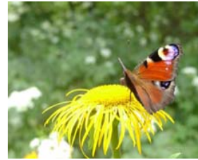
Peacock butterfly ( Inachis io )