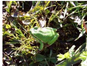
European tree frog ( Hyla arborea )