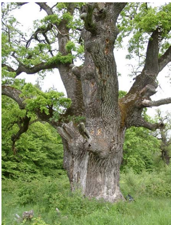
The most venerable oak tree on the plateau is over 700 years old and bursting with vitality.

BRONZE £50 – adopt a young oak tree (under 100 years old) and help it reach a ripe old age.